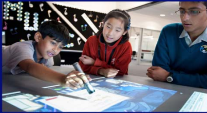
Asian students teach their teachers new tricks